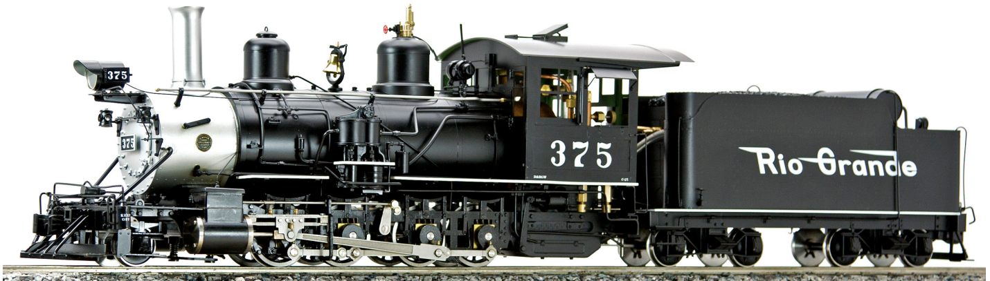
1:20.3 Scale C-25 Live Steam Shown

This locomotive, a 2-8-0 or Consolidation type, originally existed as # 103 of the Crystal River Railroad, a narrow gauge line located in the Elk Mountains of central Colorado. It was built in 1903 as C/N 21757 of the Baldwin Locomotive Works, had 33" drivers, 18x20" cylinders, and a tractive effort just short of 25,000 pounds. It was a standard Baldwin design, and other narrow gauge locos of this size and type were built for railroads in the Western Hemisphere.