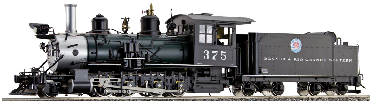
1:20.3 Scale C-25 Live Steam Shown